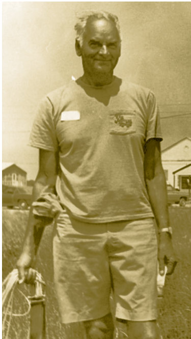
Francis Rogallo, circa 1972.